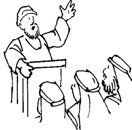
Zecha R iah

Arrange the bold letters in the blanks to complete the sentence.